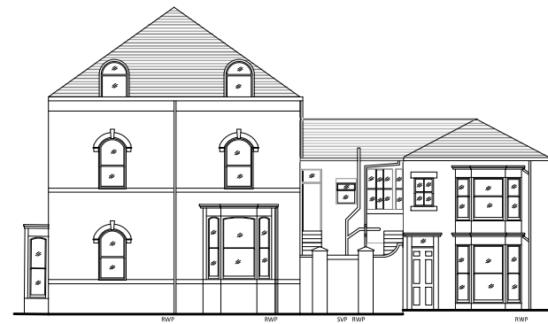
ELEVATION 03, RIGHT SIDE, LAWRENCE STREET SCALE 1:100