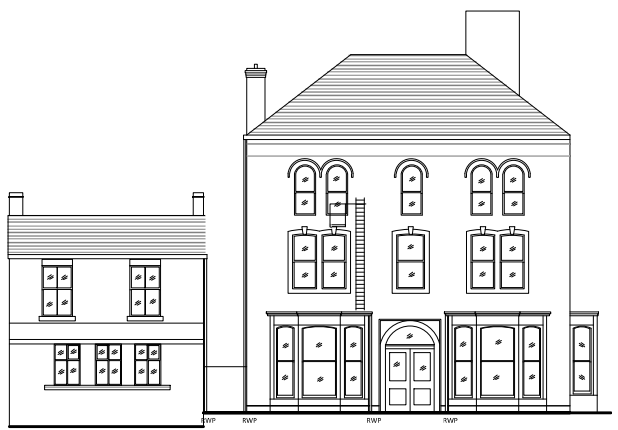
ELEVATION 01, LEFT SIDE, BOWESFIELD LANE SCALE 1:100