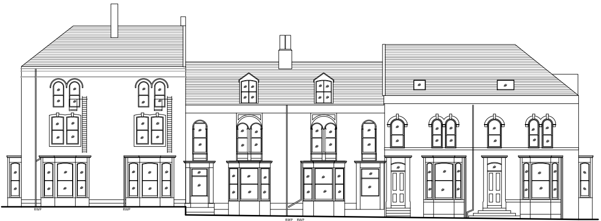
ELEVATION 02, FRONT, YARM LANE SCALE 1:100